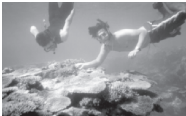
Students' snorkelling at Northwest Island in the Great Barrier Reef in 2003.

Keywords: marine education research and evaluation, learning outcomes, and experiential learning relationships