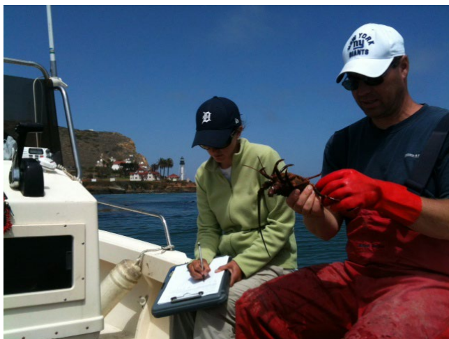
FIGURE 1 Members of the Southern California Lobster Research Group collect data on California spiny lobsters

There were two key reasons for structuring the research in this collaborative framework. First, it allowed implementation of a variety of monitoring tools. Building a strong team of researchers from academia, management and industry, with different expertise, enabled a focus on several different components of monitoring (e.g., boat-based